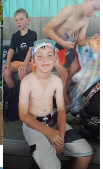
Our Huon and Channel Athletics team